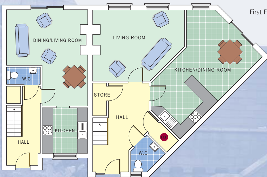
Ground Floor B